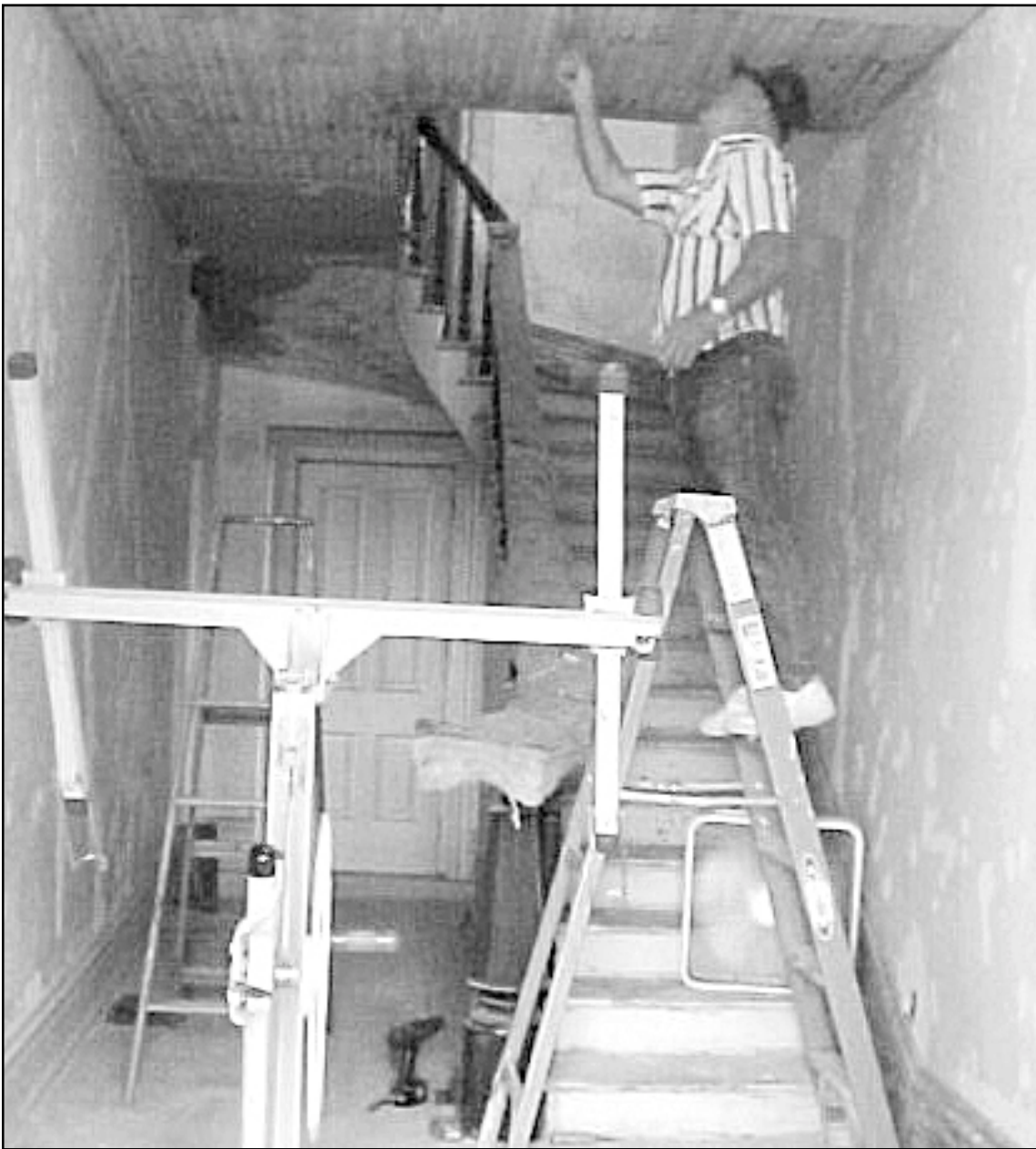
Bud Allamon prepared the ceiling of the Clark-Robidoux house in Wallace to get a covering of sheet rock.

HOUSE, from Page 1 house is completely finished, they plan to use it as a location for birthdays, weddings, anniversaries and family reunions. They will also provide catering for these occasions. When the renovation began, Glenda said, she set up a guest book for anyone who wanted a tour of the house. Although the house is not anywhere near complete, she said, it has already had almost 1,000 visitors. The house is in good enough condition that the Allamons have held functions in it, including a Memorial Day lunch and a lunch for the grand re-opening of the Fort Wallace Museum. They were used to raise money for the renovations. There will be a wedding at the house in early August. The couple has applied to the state for grants in order to help pay for the restoration, but have been denied. Up until this point, the family has done all the restoration and paid for the process from their own pocket and through donations. Many people have volunteered time to help in the clean up and help serve food at the events. For now, the Allamons are busy getting the house in shape for the wedding. After that, they will begin working on the heating and cooling systems. Anyone who would like to volunteer their time to help restore this historical monument or to take a tour should contact the Allamons at (785) 891-3789. Donations can be sent to the Wallace County Foundation earmarked for the Clark-Robidoux House.