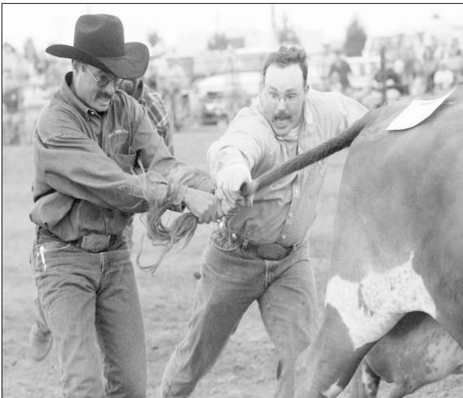
Middle Fork Ranch team members tried to slow down a troublesome cow they had roped so they could begin milking her in the wild cow milking competition. It was one of the contests at the Ranch