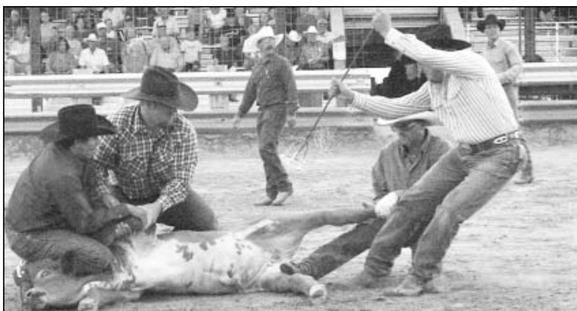
The G&R Cattle team, sponsored by Kear's Quality Liquors, tried to hold down a cow for branding during one of the four contests at the Ranch Rodeo.