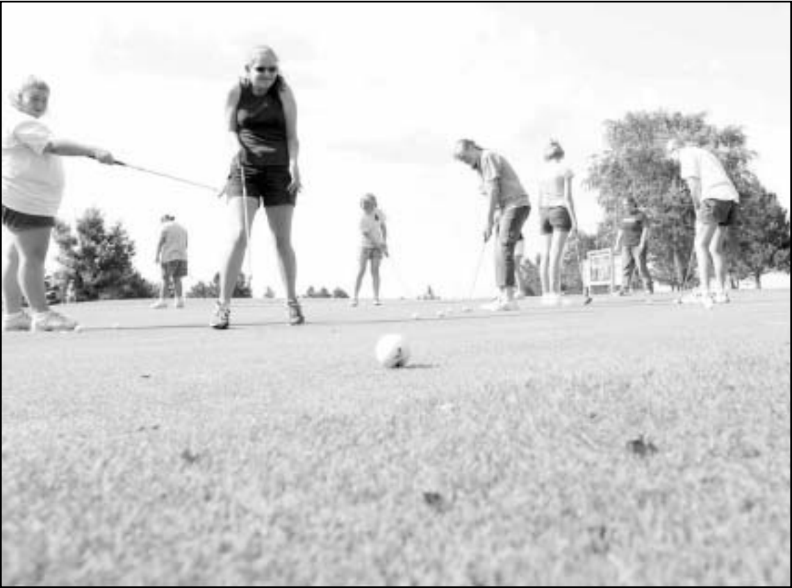
The Goodland High Cowgirls golf team practiced putting at Sugar Hills Golf Course on Tuesday afternoon. The team will have morning and afternoon practices for the first two weeks.