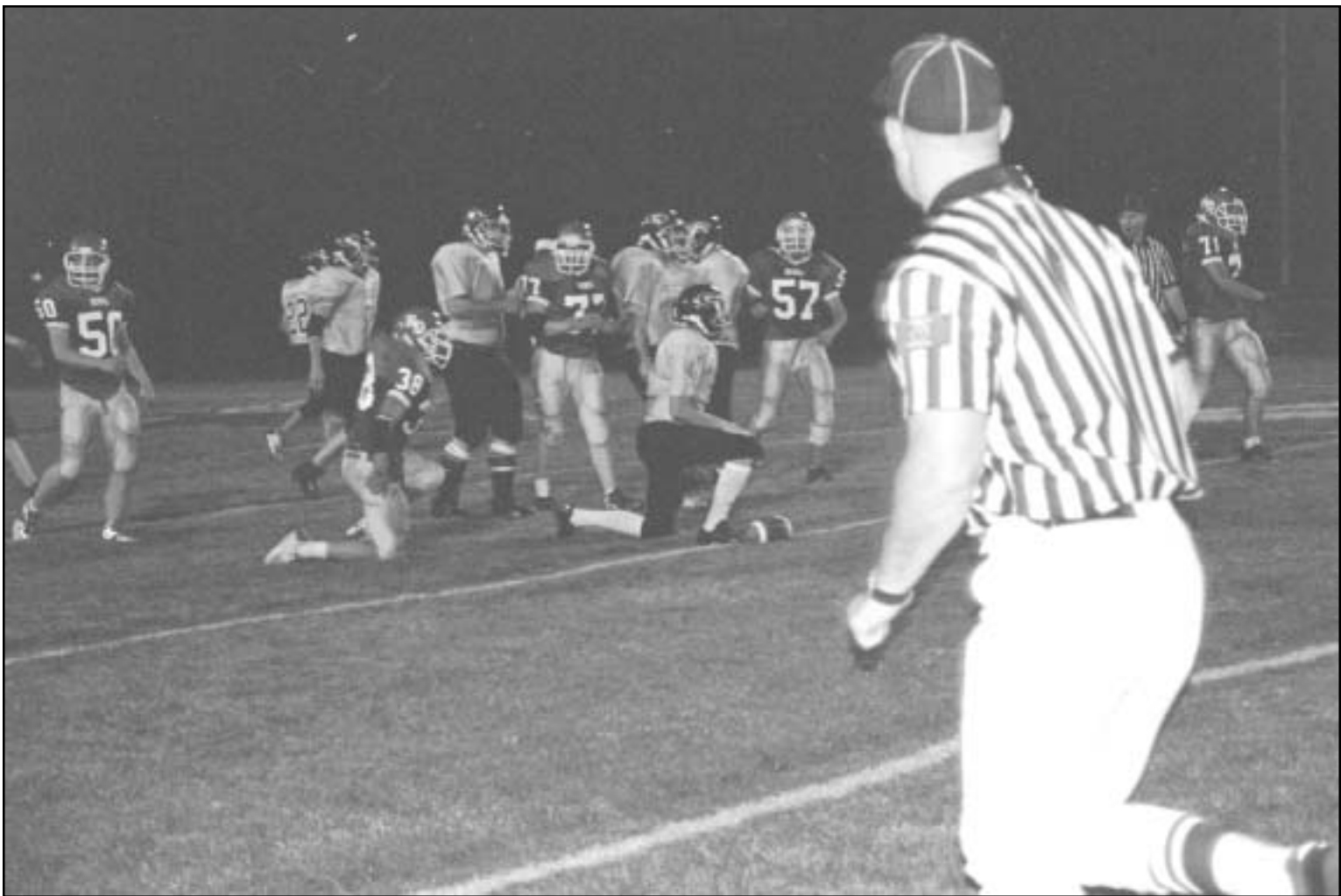
The officials kept busy Friday as Goodland and Decatur Community High teams fought a tight battle on the Oberlin field. The Red Devils came from behind in the second half, stopping the Cowboys' offense and then taking the lead 20-19 with a last-minute touchdown.

Three other teams, besides Goodland, dropped out of the Class 4A top 10. One of the teams entering the list this week is Ulysses at No. 7. The Tigers are 6-0 overall and is 4-0 in the Mid-State League.