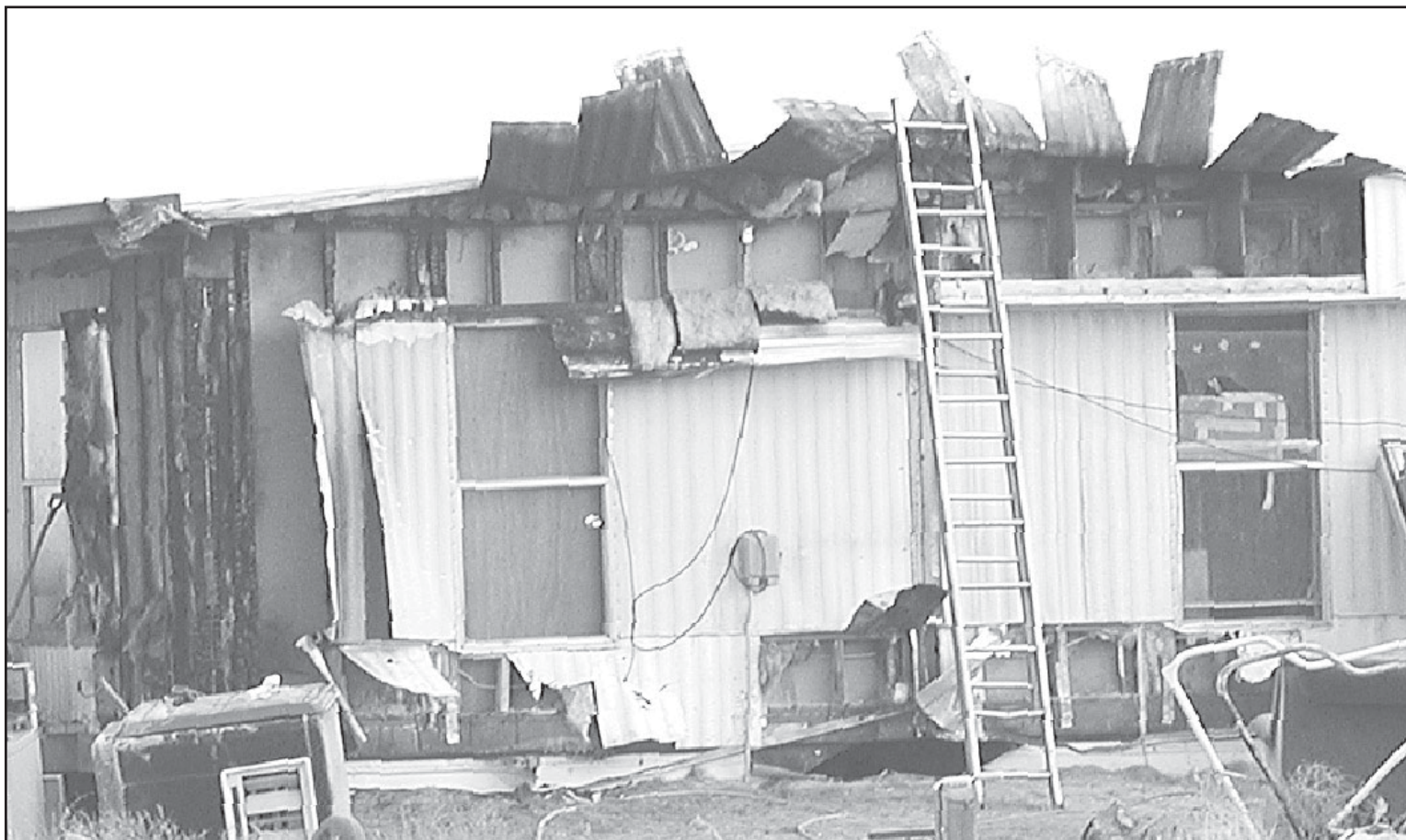
The Pummers' trailer home at 5925 County Road 21 caught fire early Thanksgiving morning. Rick and Krista Pummer and their three children escaped without injury.

Emergency relief funds have been established at the Bird City, St. Francis and Goodland branches of First National Bank.