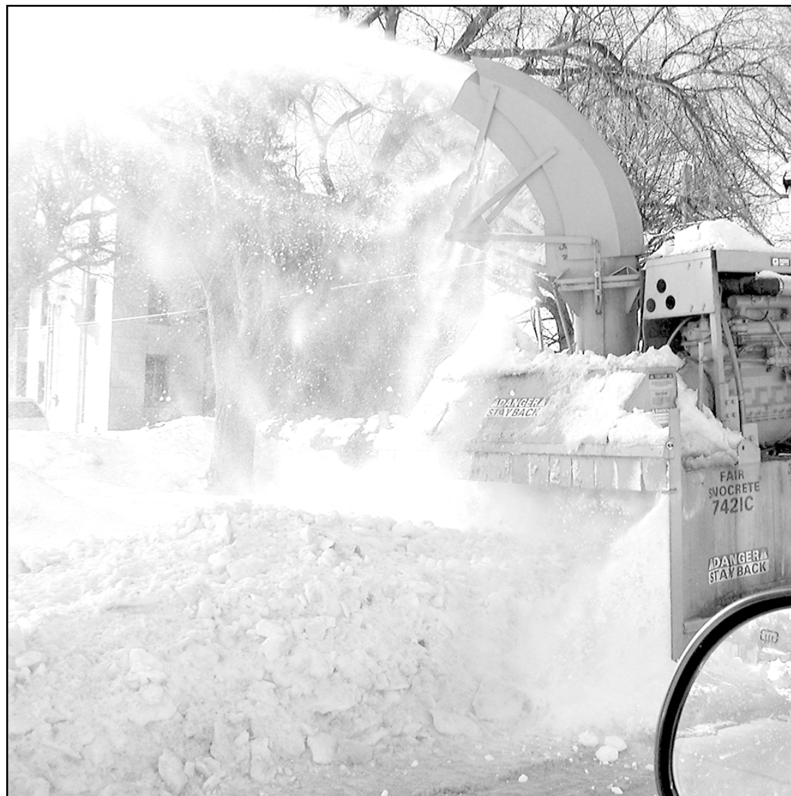
City of Goodland public works crew used a snow blower hooked on a front loader to remove ice and snow from the middle of Eighth Street on Monday morning. Snow removal from the recent winter storms has been a monumental task.