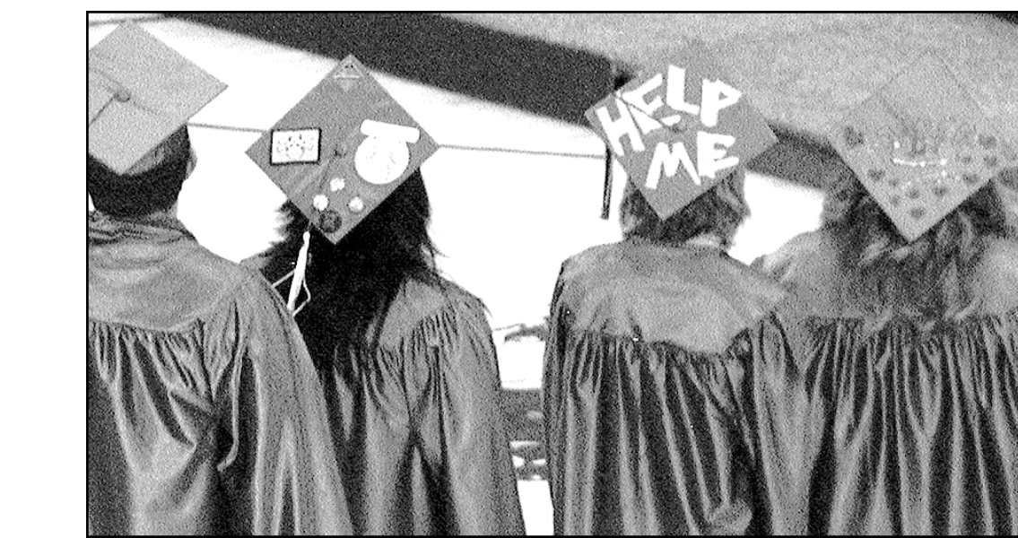
Several graduates in the Medical Assistant program spent extra time decorating the tops of their mortarboards.