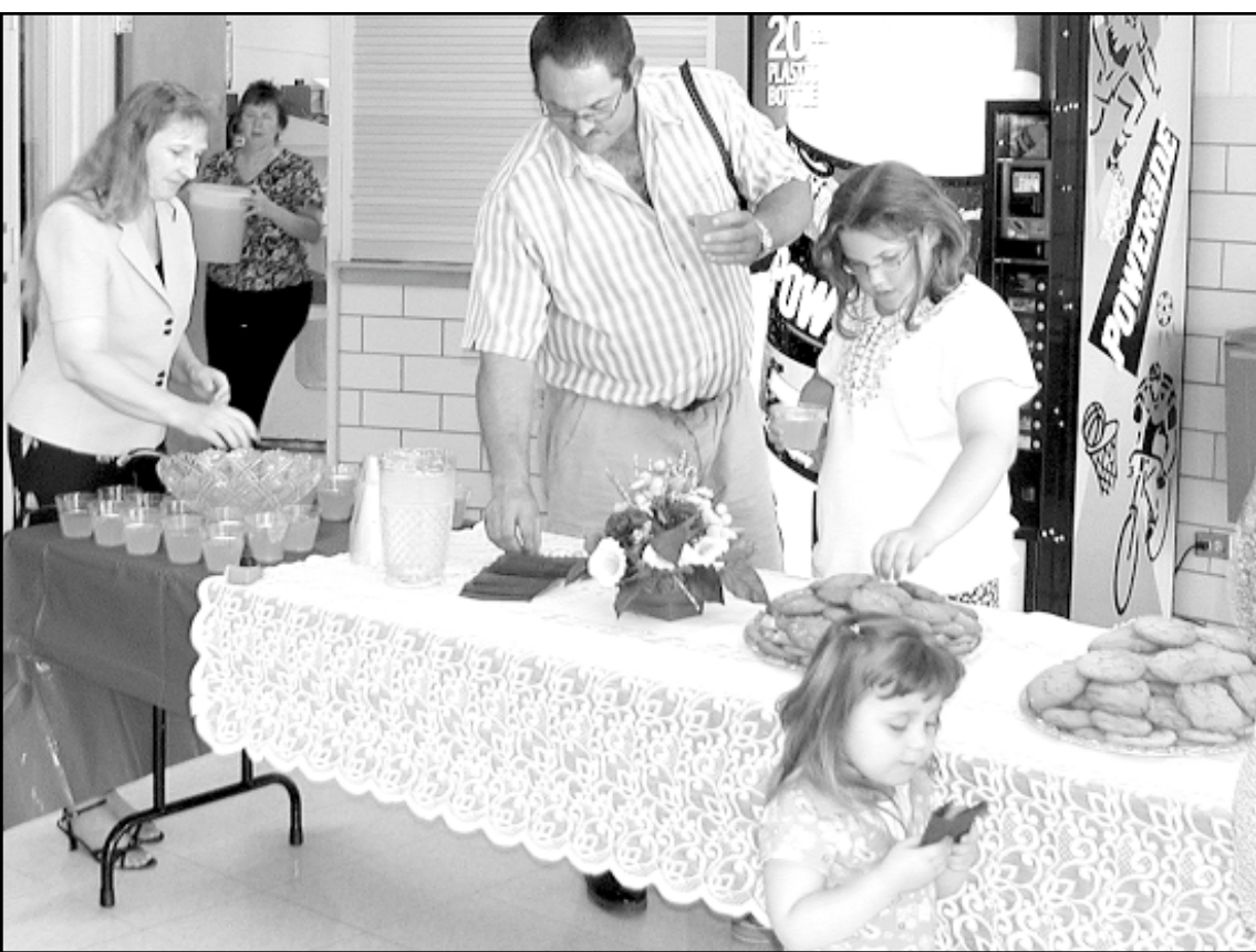
After the ceremony, an informal reception was held in front of Max Jones Fieldhouse. Those who attended could pick up a cup of punch and some cookies as they headed out the front doors.