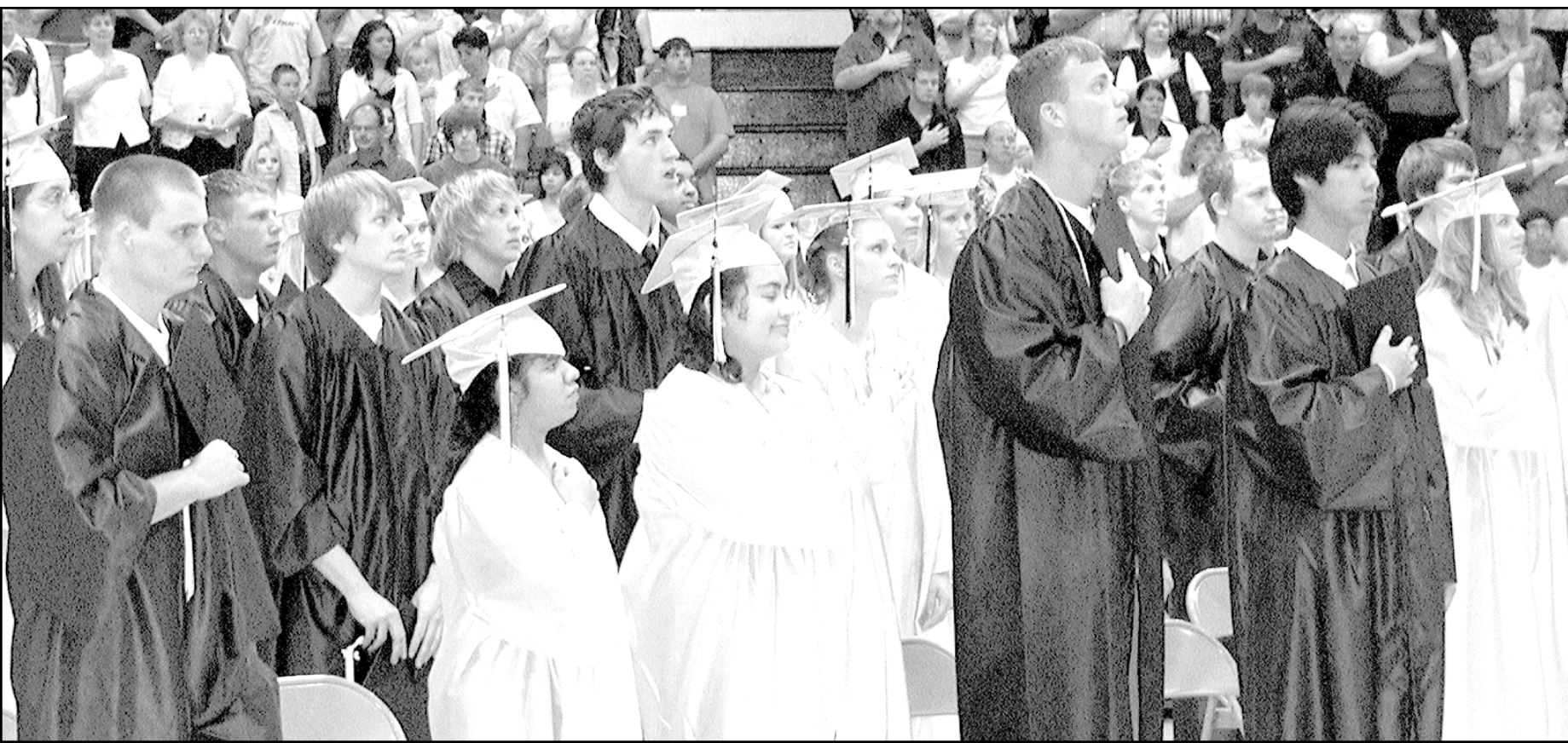
The pledge of allegiance opened the Goodland High School graduation ceremonies Saturday afternoon at Max Jones Fieldhouse.