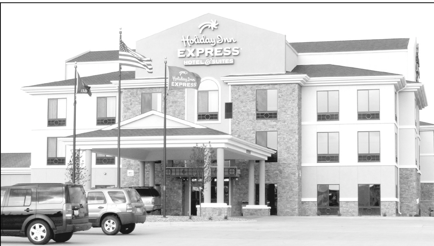
A 73-room Holiday Inn Express owned by Goodland people opened this month, and has been called the "Ritz" of Northwest Kansas.

Goodland's newest lodging facility, Holiday Inn Express and Suites, opened on June 5, south of the west exit on I-70.