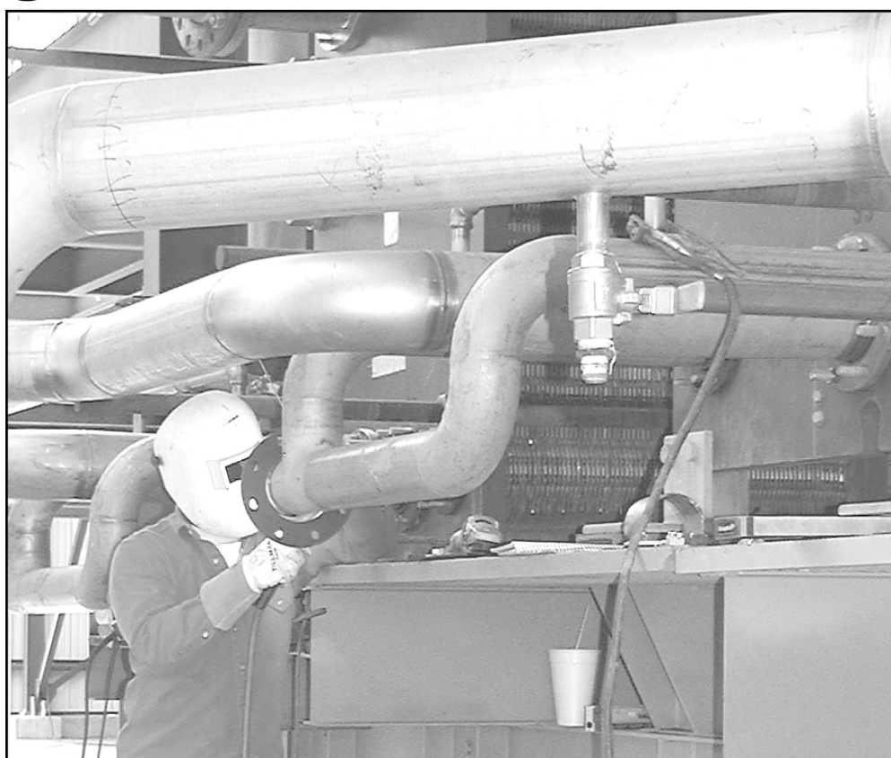
Inside the E Caruso plant a worker welded a pipe fitting as part of installing the equipment used to produce the ethanol. Construction is moving along and the plant could be producing by the end of the year.

He said the plant could be constructed if the financial outlook improves.