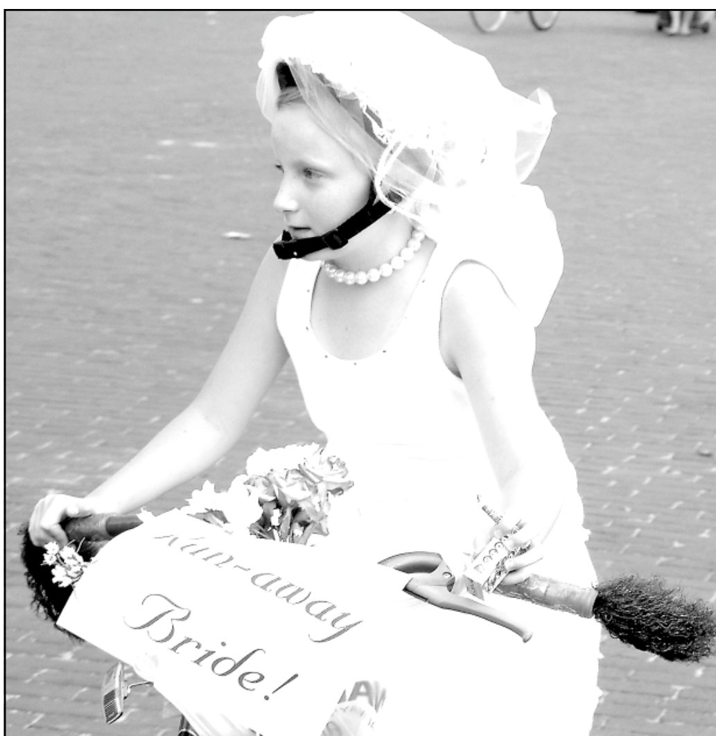
The Northwest Kansas District Free Fair began Saturday as the parade marched up Main Avenue from 17th to Eighth. The parade, which lasted 25 minutes, featured floats from the county 4-H clubs using the theme "Going Back to the Good Ole Days." The Prairie Dale 4-H club float (top right photo) had members sitting around enjoying the relaxing summer, with two hanging fishing lines off the tail end. Kids along the parade route rushed out to gather all the candy being thrown, and one of the participants (top left photo) had to give his sister a piece to help keep her toy truck moving the right direction. A young girl on a bicycle (left photo) was dressed as a character from the movie "Runaway Bride." The parade judges (below), on a truck in front of Central Elementary School, watched the entries as they went by.