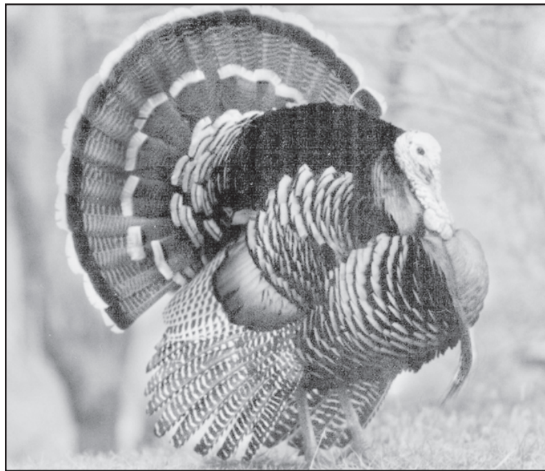
THIS tom turkey fanned his tail feathers in full strut.