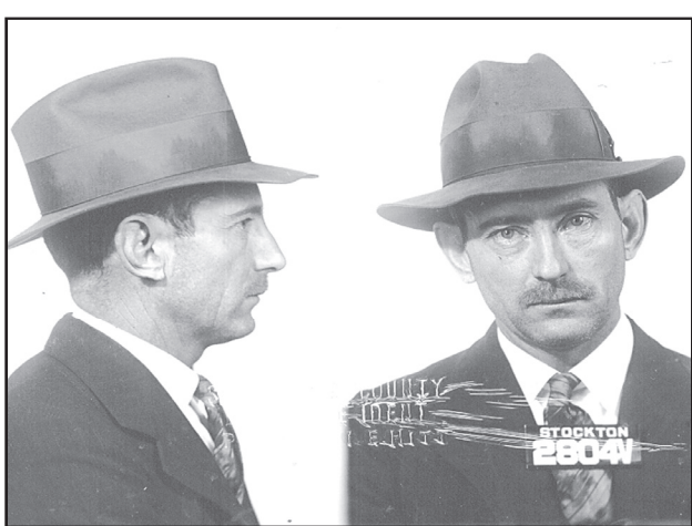
Jake Fleagle's arrest photo taken at Stockton, Calif., in the spring of 1929 that led to the break in the First National Bank of Lamar robbery and murder case. The photo and fingerprints were sent to the FBI in Washington where the connection was made.

A few signed copies are available at The Goodland Star-News, 1205 Main