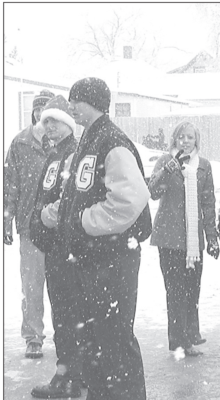
Goodland High School students waited to escort people from their cars to the Goodland Schools' senior citizen dinner Friday. The dinner had been postponed from Wednesday due to snow and wind.