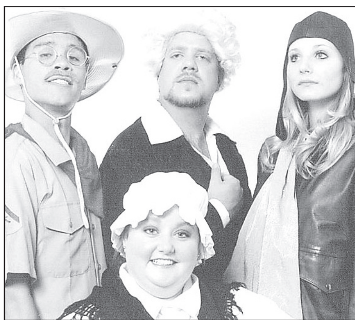
Wichita Children's Theatre Professional Touring Co.

This rendition of "Yankee Doodle" portrays events from the past through drama, music, dance and mime, the company says.