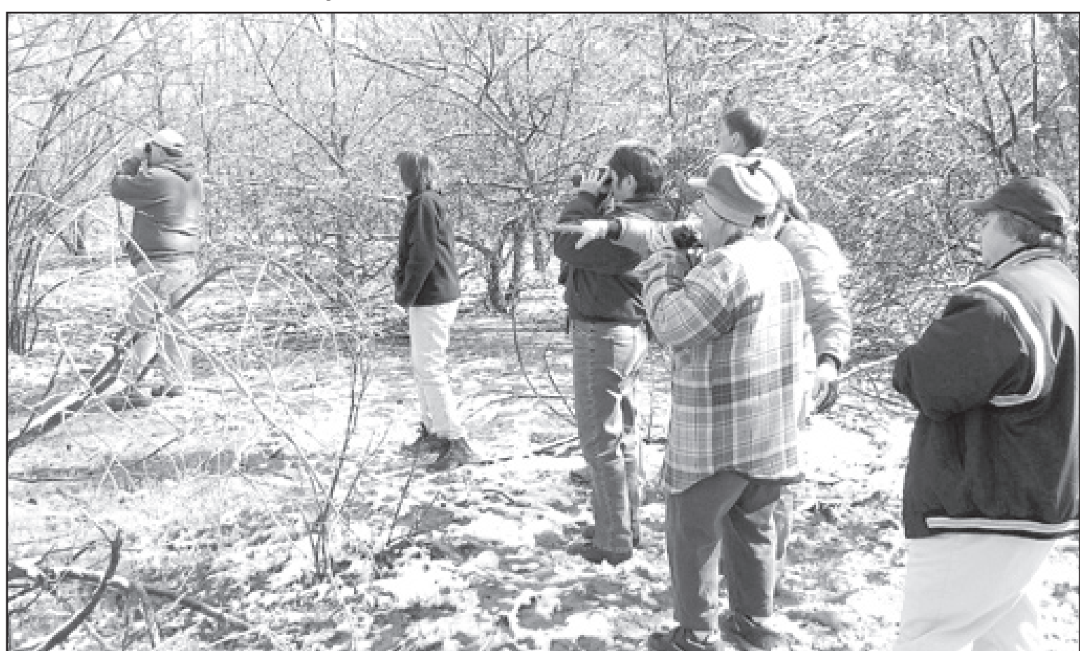
Members of the Kansas Ornithological Society looked for bird species along the St. Francis River Walk during their spring meeting,