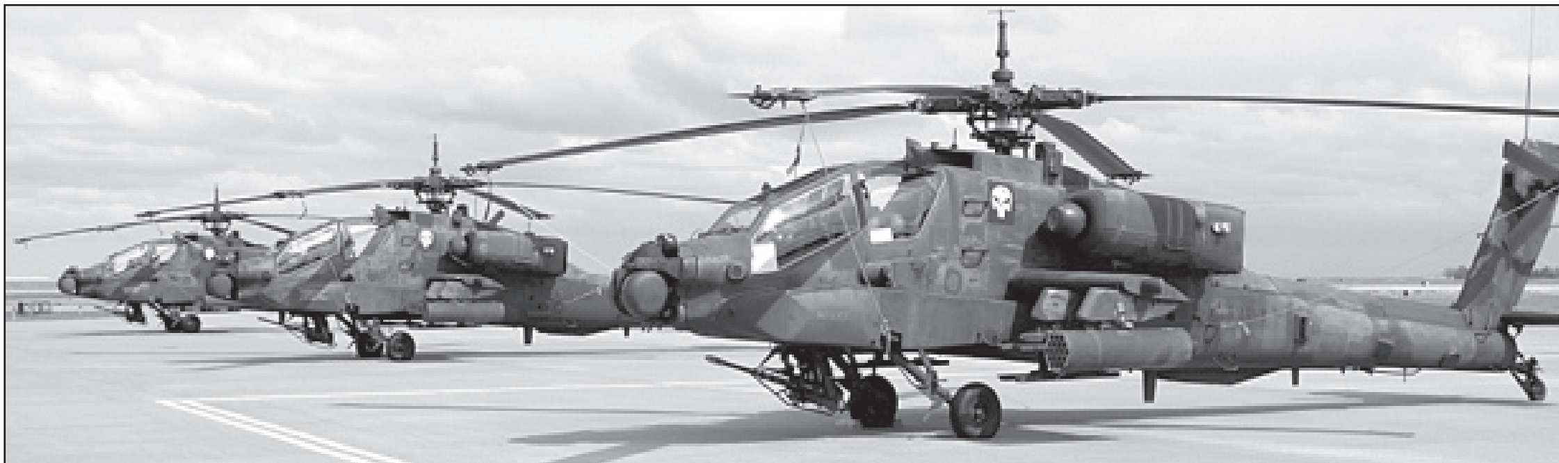
A squad of five U.S. Army Apache helicopters landed at Goodland's Renner Field last Thursday, and because of weather, stayed through Friday on their way across country. The AH-64 Apache,