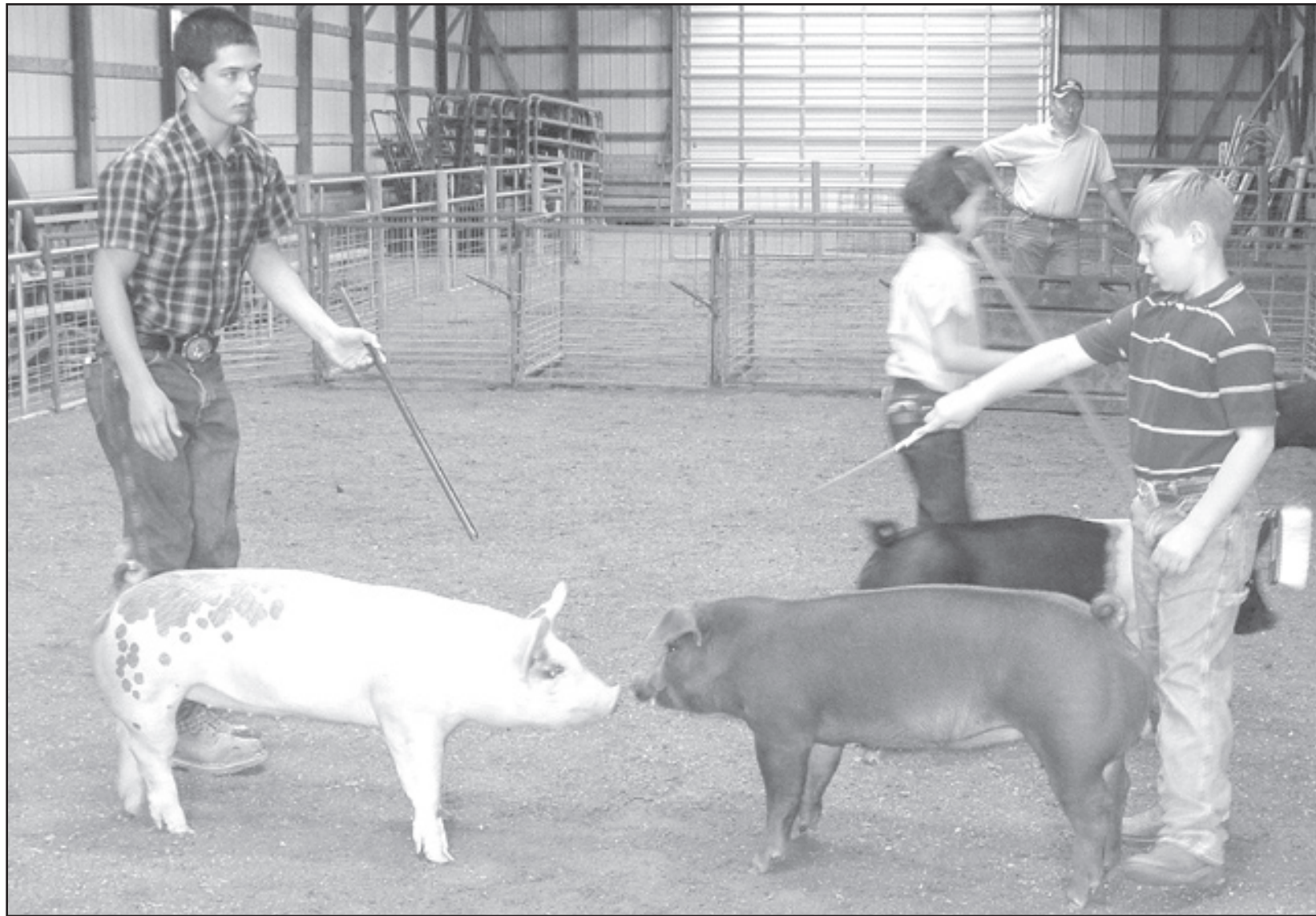
Two hogs seemed to be checking each other out as they were walked around the arena by their owners under the watchful eye of the judge.