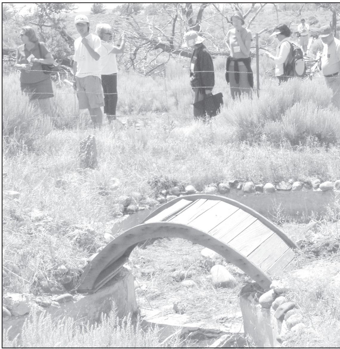
Internees and family members look at a Japanese fish pond built at Camp Amache by the people who lived there during World War II. Many traveled from Denver to the site last weekend.

Some of the Amache internees were allowed to go into nearby towns like Lamar to see movies and to go shopping. It was not all good, and there were many emotional stories about the hard times and