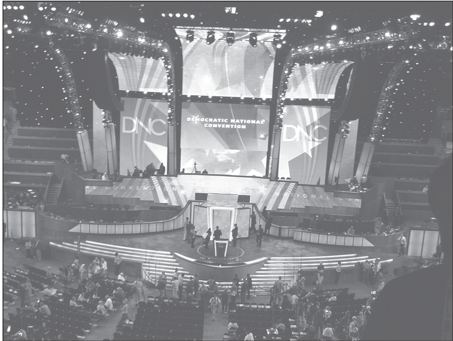
Technicians prepared the stage at the Pepsi Center in Denver Tuesday for the afternoon session of the Democratic National Convention. Gov. Kathleen Sebelius was among the speakers on the