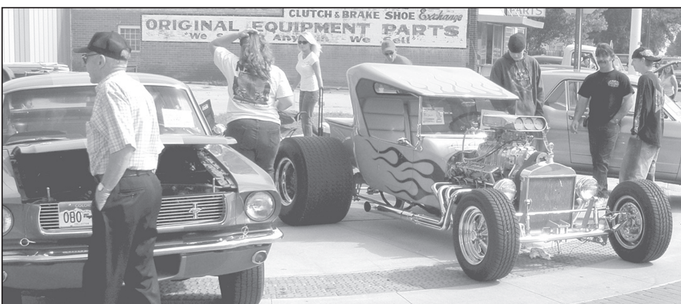
The Brick Top Cruisers Car Show had cars for everyone to enjoy with the 157 entries on Saturday including many antique, classic, restored and modified hot rods including a T-Bucket and more than one Ford Mustang.

The bike riders started from the north end at Ninth while the car show people lined up at 17th. The two lines passed each other about 12th as they drove or rode to the thrill of the estimated 900 people who watched the parade lining both