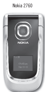
Nokia 2760 Capture vibrant videos and images!