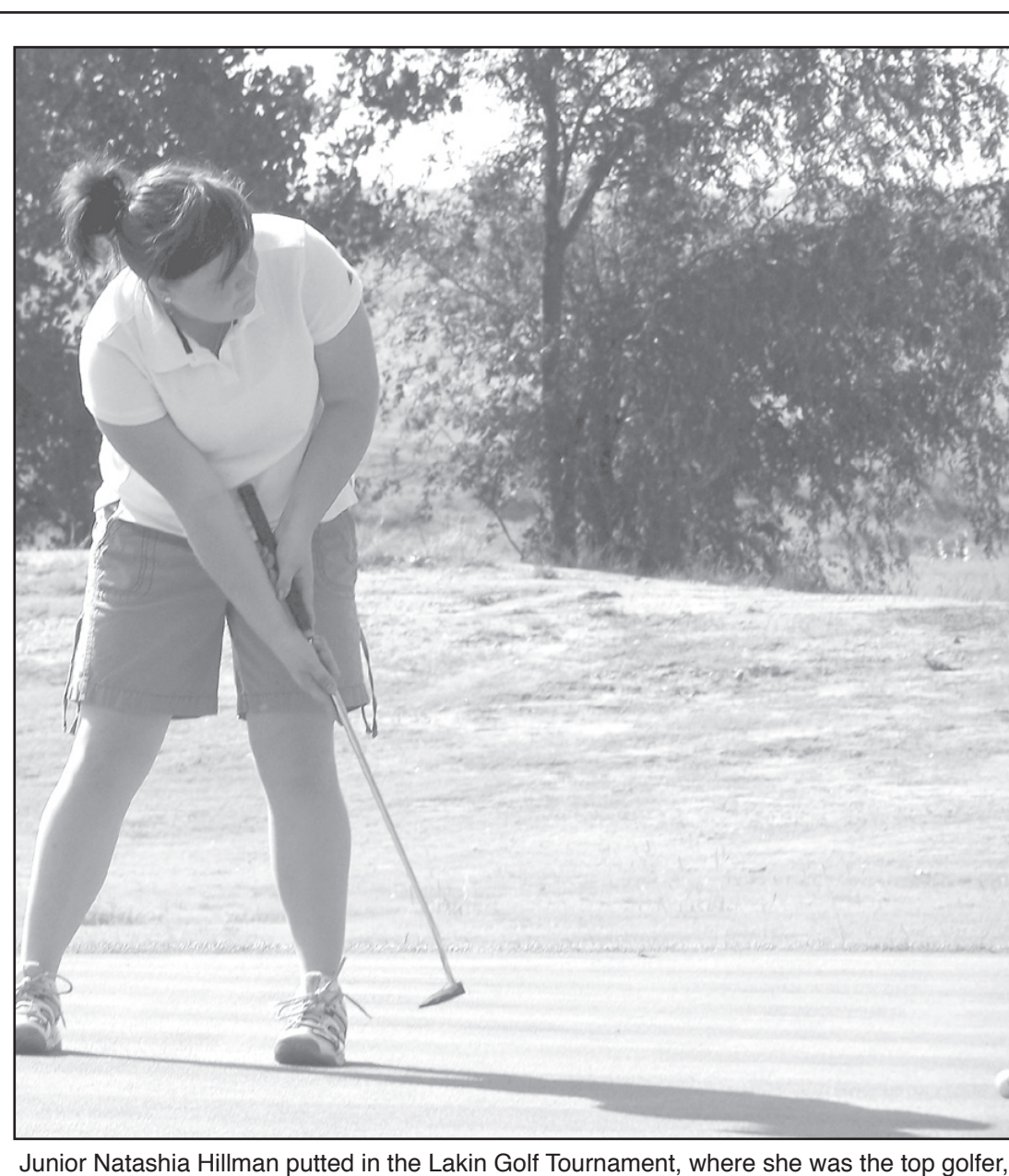
helping to propel the Cowgirls to victory and achieving their goal of beating the Larned team.