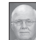
Ralph Ostmeyer State Senator