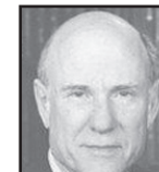
Pat Roberts U.S. Senator

Vote REPUBLICAN for all Sherman County races!