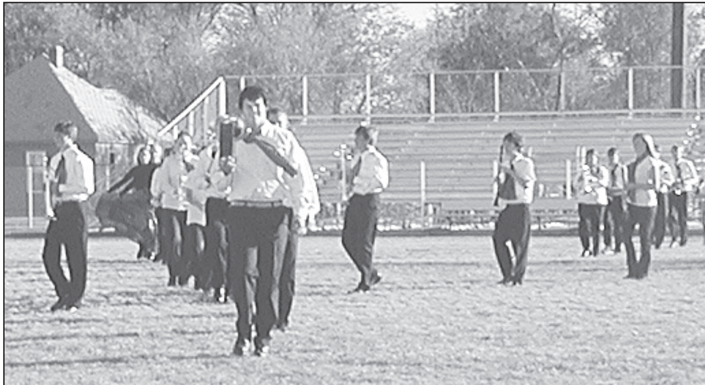
The band crisscrossed as part of its entrance onto the football field to get into position to perform its marching routine.