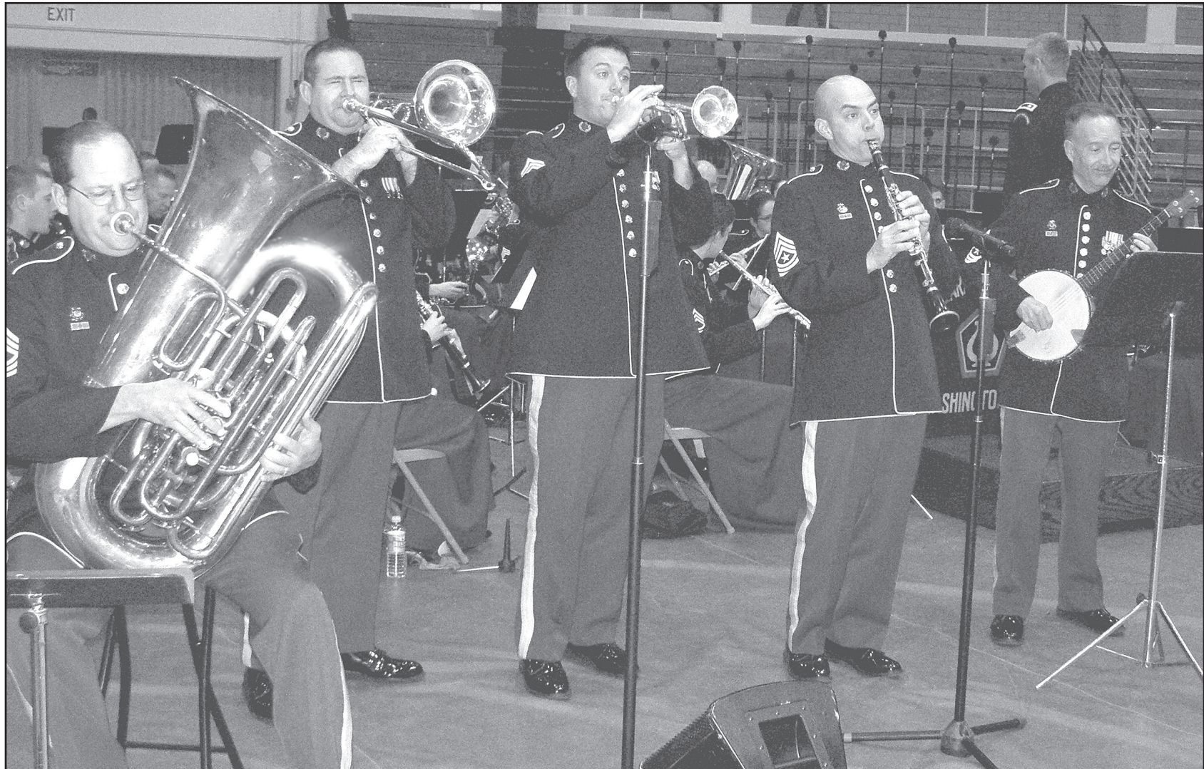
A small section of the Army Field Band were the soloists for a special collection of jazz songs for A Walk Down Bourbon Street.