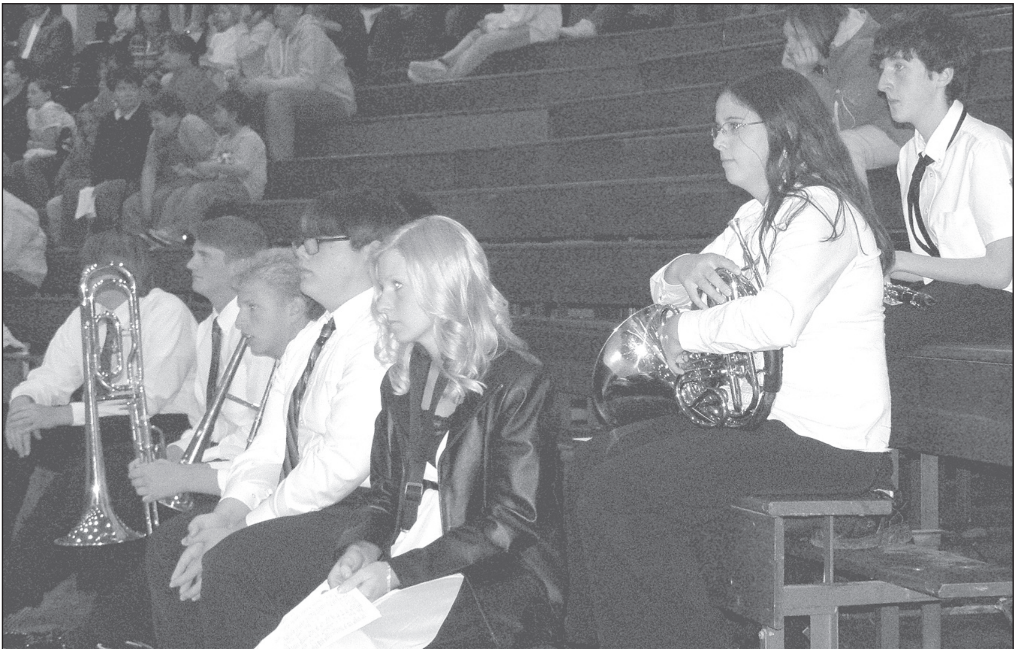
Goodland High School band students watched the Army Field Band concert Thursday at Max Jones Fieldhouse, and waited for their chance to join the band for a special perfor-