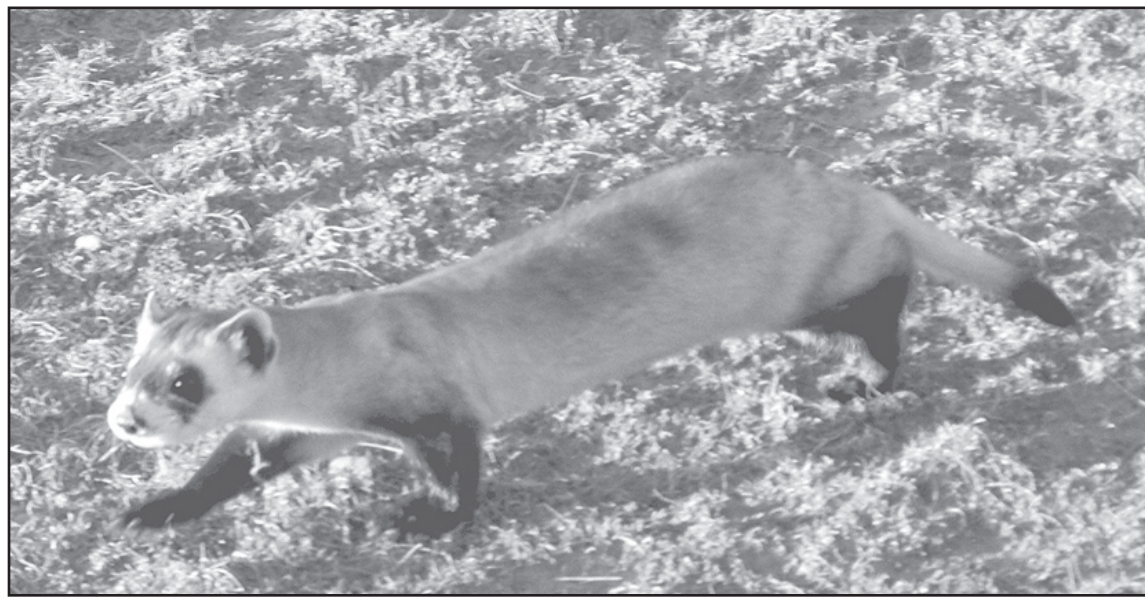
A newly released black footed ferret heads for a prairie dog hole to make its home.

The Black-Footed Ferrets were thought extinct about 25 years ago, but a small enclave was found in Wyoming and under the Endangered Species Act the Fish and Wildlife Service has been raising ferrets and finding places to reintroduce them.