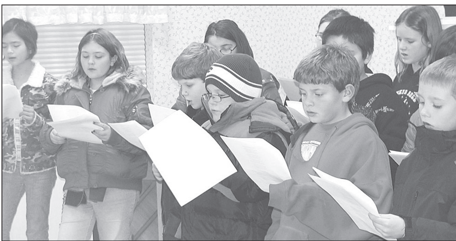
Members of Sunflower 4-H Club sang Christmas carols on Monday afternoon for residents of Wheat Ridge Acres Retirement Community.