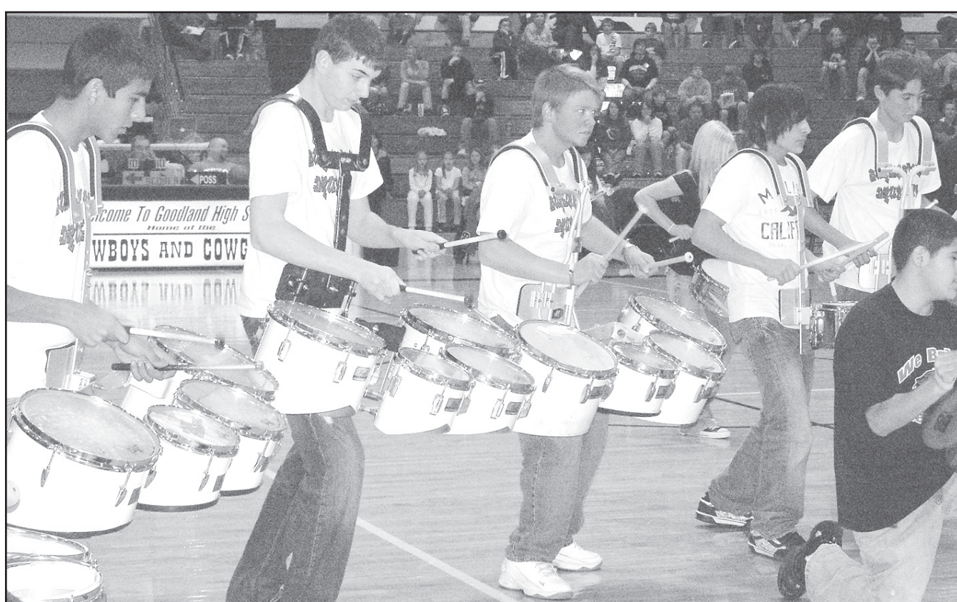
The Burlington High School drum line (above) entertained at the Topside Tip-Off on Saturday at halftime of the girls' championship game. The audience gave the drummers a standing ovation. On Saturday Santa Claus (right photo)

Goodland has been a longtime member of the Northwest Kansas League.