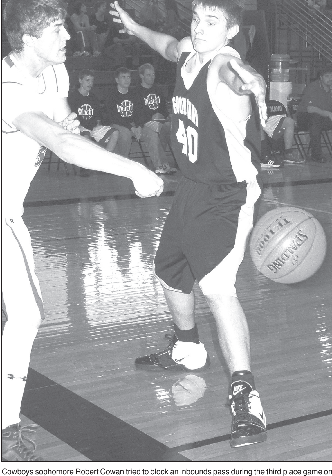
Saturday at the 20th Annual Topside Tip-Off against Wallace County. The Cowboys lost 73-45 to finish