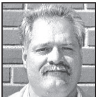
dana belshe • ag notebook

Scale insects are easily overlooked because they are small and immobile most of their lives, and