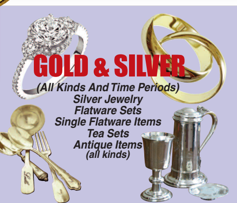
GOLD & SILVER

(All Kinds And Time Periods) Silver Jewelry Flatware Sets Single Flatware Items Tea Sets Antique Items (all kinds)