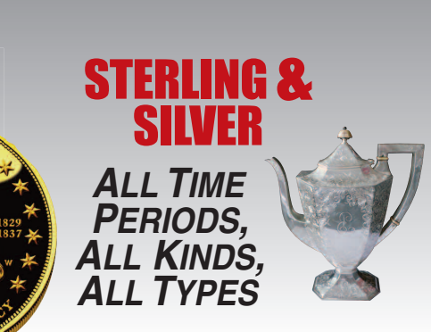
STERLING & SILVER

SUPER 8 - Goodland 2520 South Hwy 27 (Across from Conoco) Saturday, July 17th Sunday, July 18th Open 9 am to 6 pm