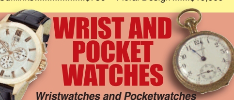
WRIST AND POCKET WATCHES

Wristwatches and Pocketwatches All Time Periods, All Kinds, All Types Rare Watches Worth A Fortune In Cash! Pay Up To The Following: