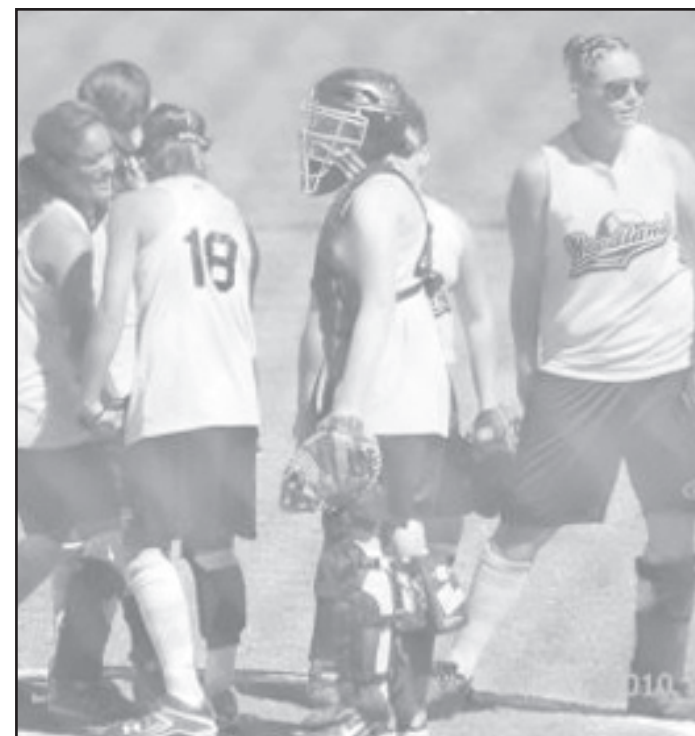
Members of the Goodland Slammers 14 and under Fastpitch team met at the pitchers mound during a game at the Super 'C' in Dodge City. The Slammers were in Emporia over the weekend for the 14 and under state championships.