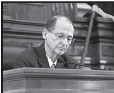
Rep. Morrison, shown here in the House Chamber at the Capitol, works diligently on multiple committees in the Legislature.