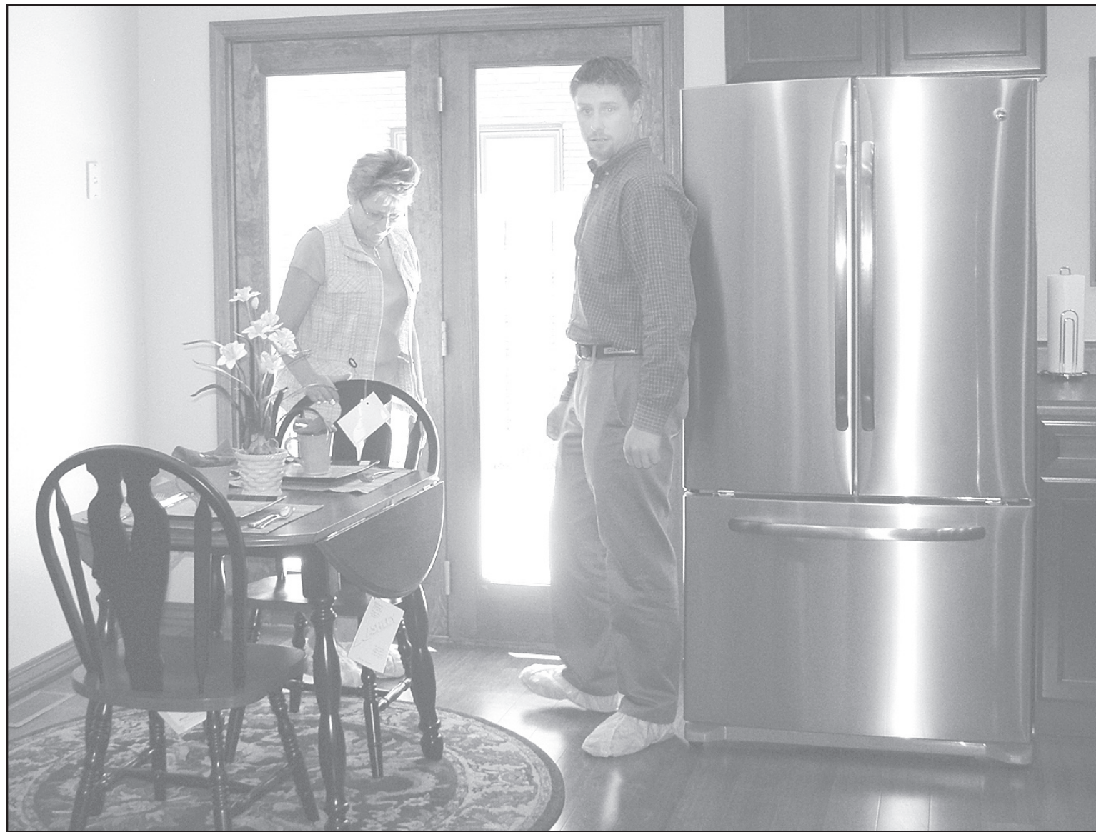
Two of the many people who attended the open house of Betz-Saint remodeling project done by the students at Northwest Technical College this last year. The sale of the two bedroom house will be used on the next project of the school. Students in engineering