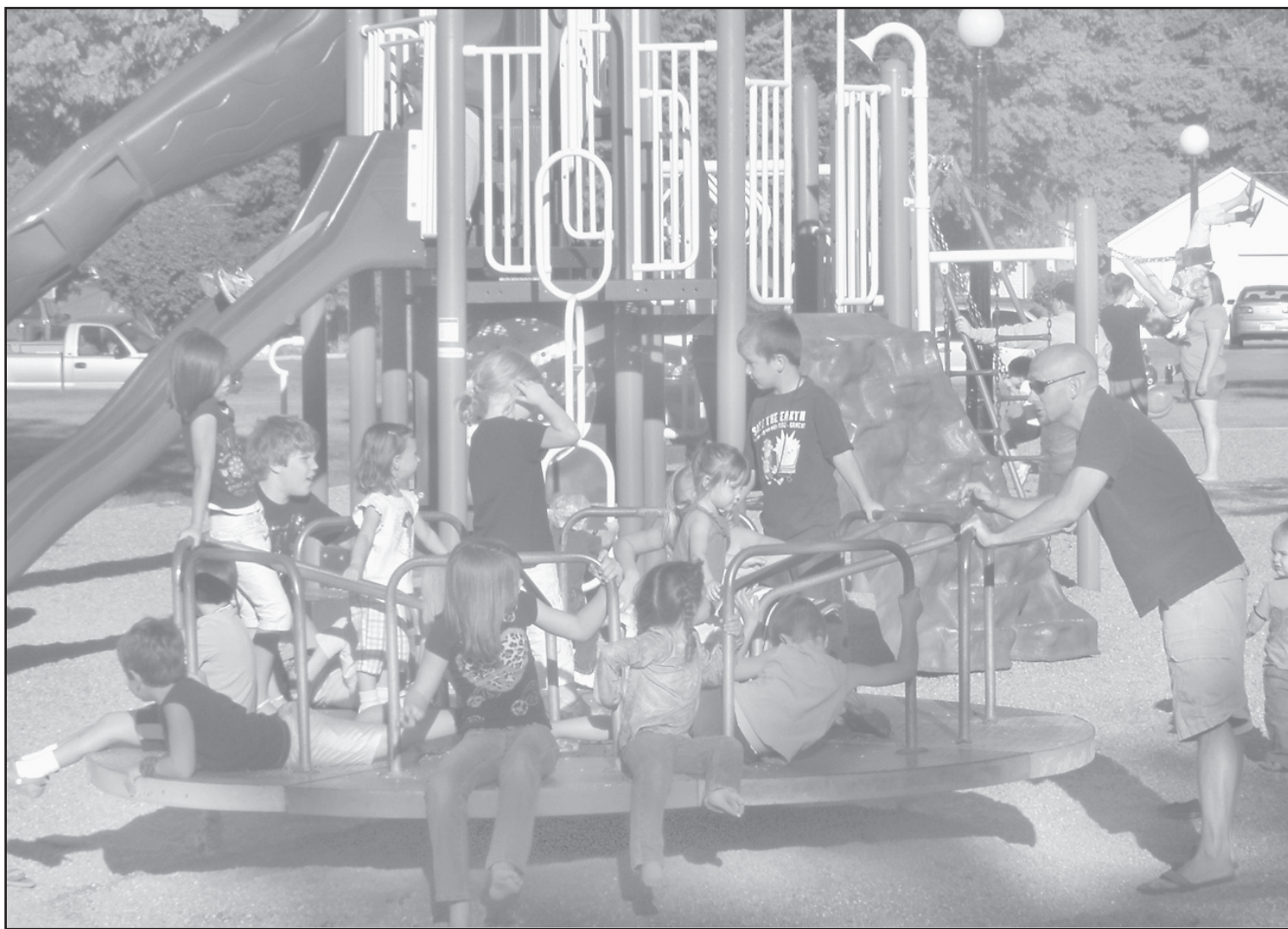
Mothers of Preschoolers had their kickoff at a picnic at Gulick Park on Sunday afternoon. Also at the park was a birthday party and the park was full of kids. The next meeting for MOPS will be at 6 p.m. on Monday, Oct. 4 at the First Baptist Church.