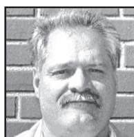
dana belshe • ag notebook

Flowering will not occur unless induced by temperature and/or light