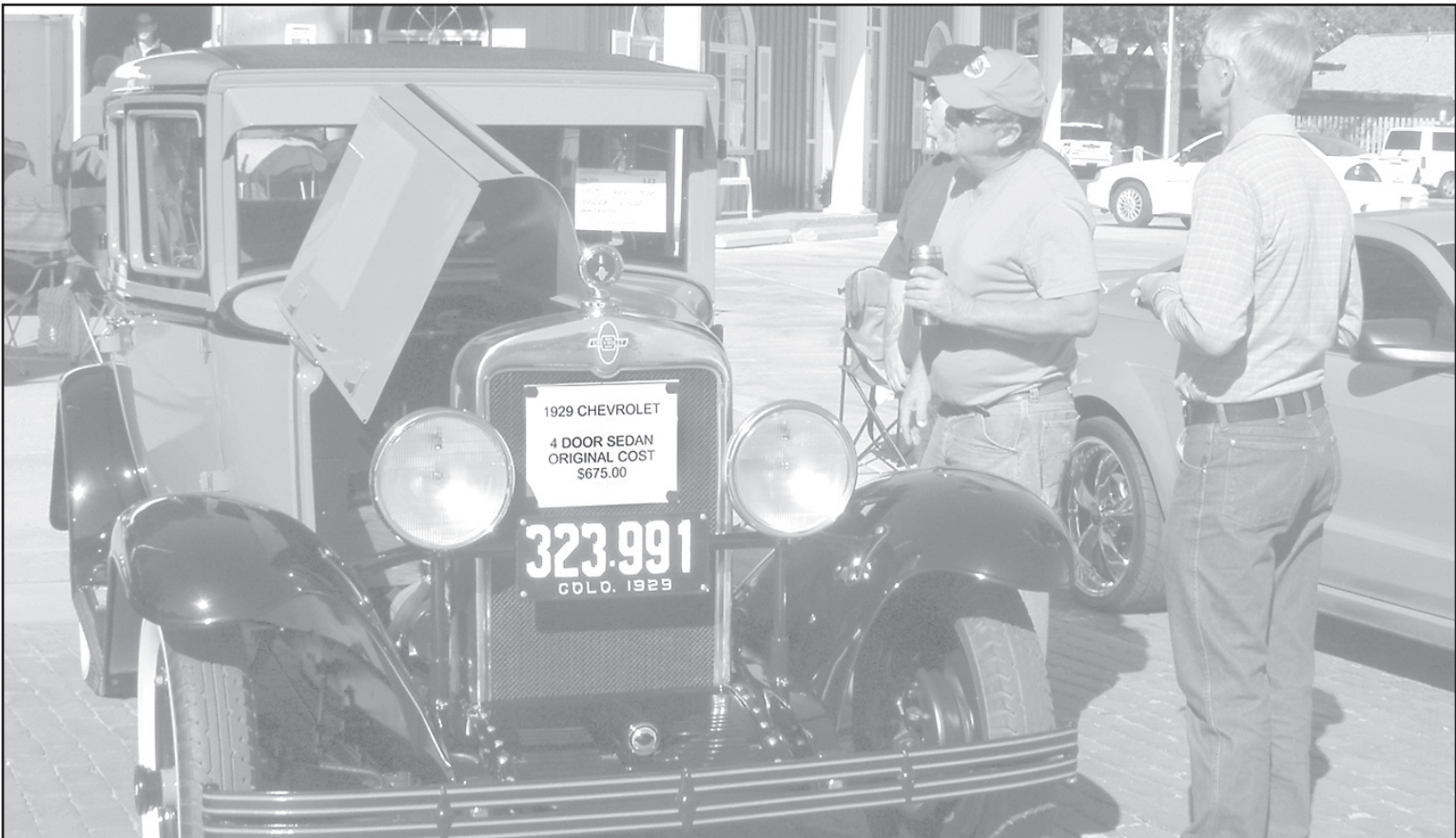
This 1929 Chevy in original condition was a big hit at the 24th Annual Flatlander Festival Car Show held on Saturday.