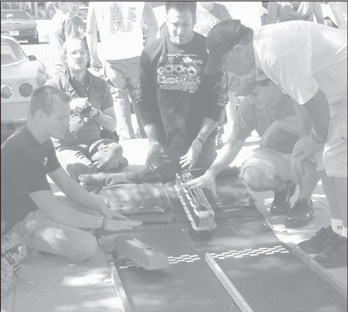
Determining the Valve Cover race winner was easy sometimes, but frequently the two were so close they had to rerun switching lanes to see who was the winner. A total of 23 Valve Covers were entered in the three classes.