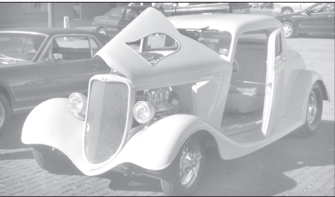
Lilac was the striking color for this decked out hot rod.