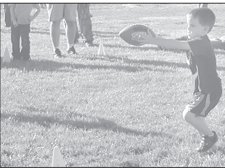
Two of the 42 boys and girls that participated in the Punt, Pass and Kick contest held by the Goodland Activities Center. Each kid got to throw a pass, drop kick a ball and kick a punt. There were five different age groups for the kids.

The fourth grade game starts at 9:30 a.m., the fifth grade game at 11:00 a.m. and the sixth grade game at 12:30 p.m.