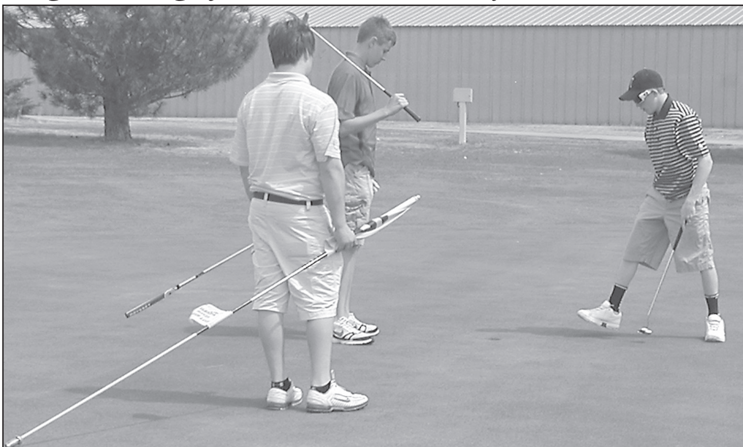
High School junior varsity golfers from around the area will take to the links at Sugar Hills Golf Course at 1 p.m. today for a junior varsity tournament. The Cowboys will be hosting the tournament