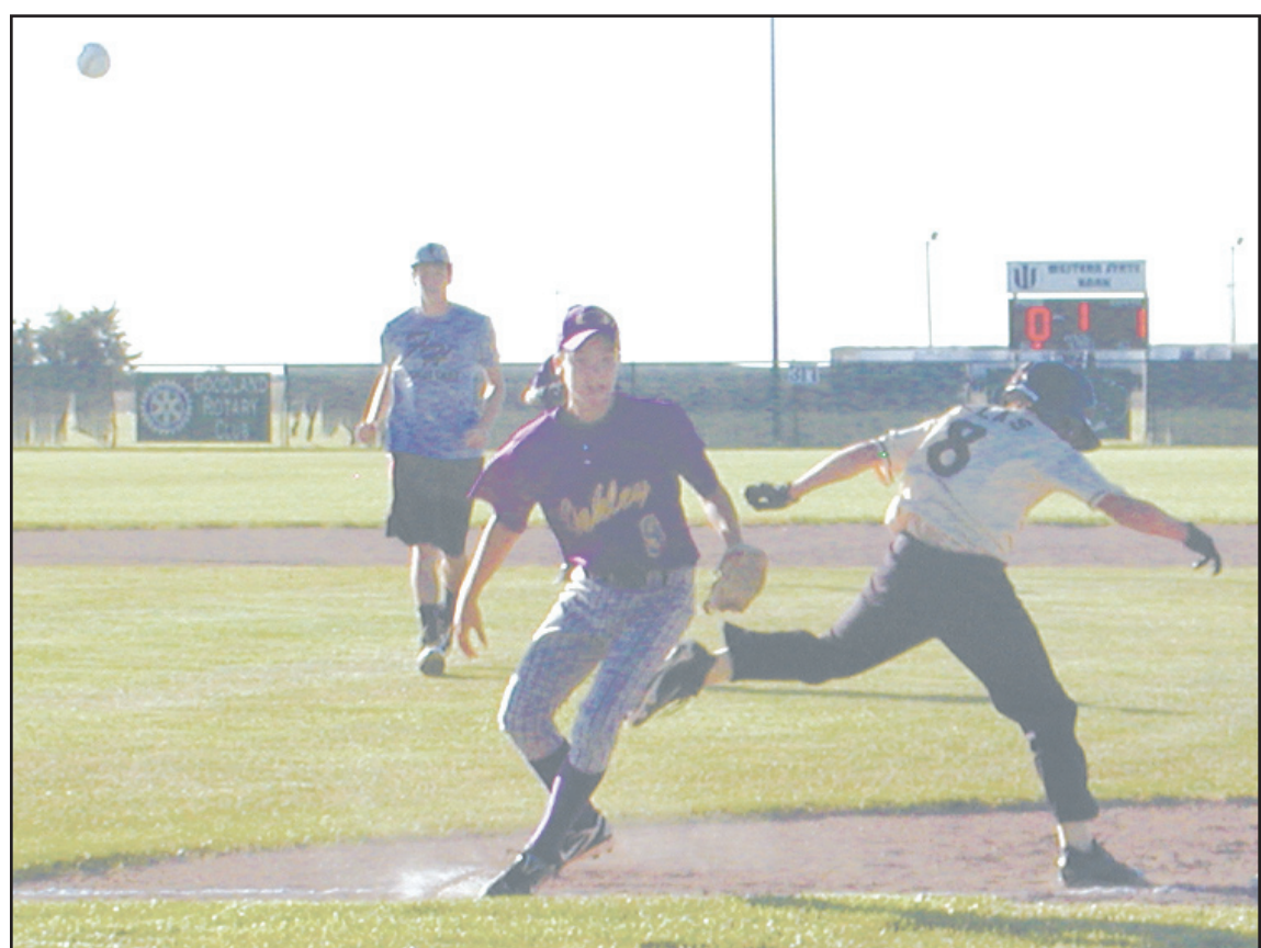
A foul ball sails over the head of the Oakley catcher and umpire (left photo) in the first game the Goodland Elks K-18 played on Wednesday at Memorial Field. A Goodland runner (above photo) rounds first and runs to second on the overthrow at first by Oakley. Goodland won both games 11-1 and 16-5.