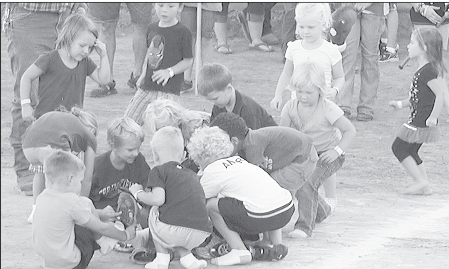
At the boot race at the Howdy Rowdy Rodeo on Monday night kids took off their shoes and they were placed in a pile. Then the kids were taken to the start line. They had to race to the pile, find

their shoes, put them on and run back to the start line.