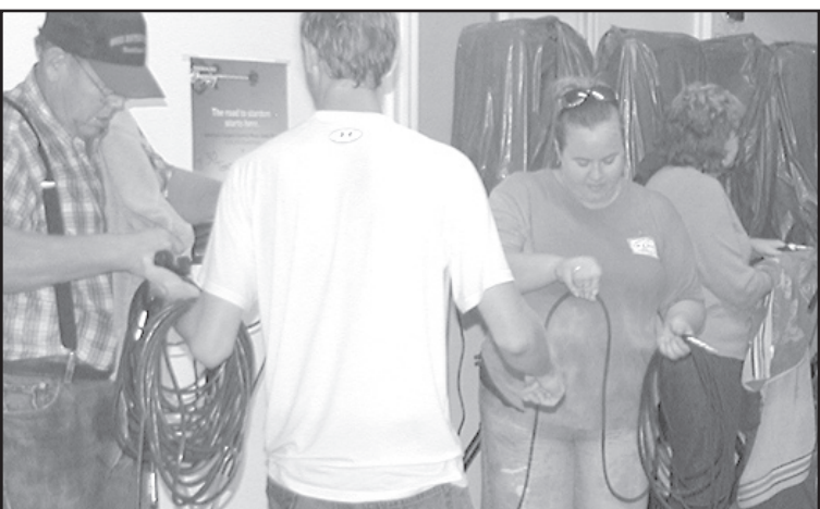
Everyone helped wipe down wet cables and equipment to move the talent show from outside to inside on Thursday when a thunderstorm dumped about an inch of rain closing the carnival and games. The talent show was moved to the south end of the Ad. Building.