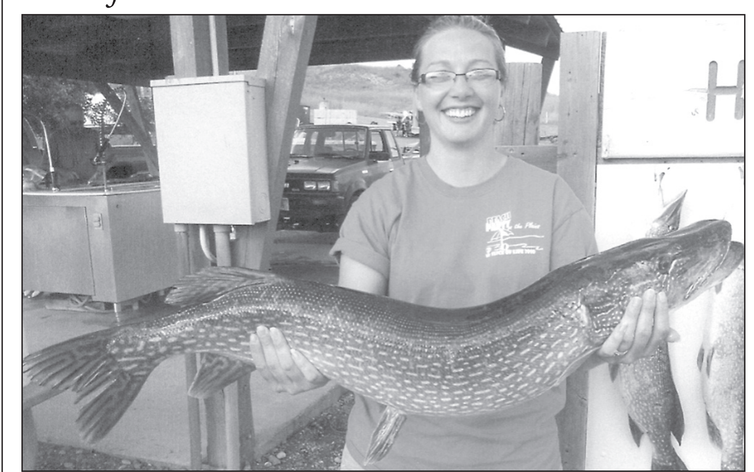
Jordan, Mont., to fish at Hell Creek State Park. On Saturday, proximately 20 pounds.