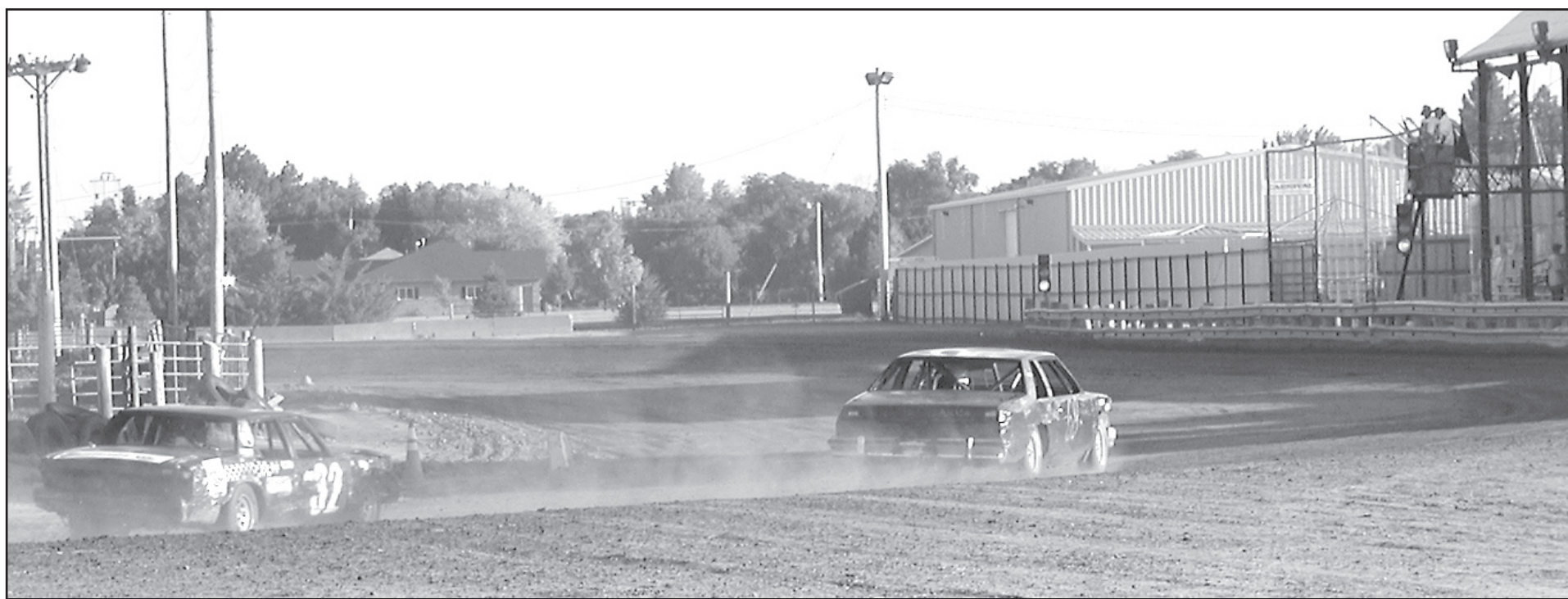
Stock cars race around turn four to head down the straight away at the Sherman County Speedway during the Bill Gray Memorial held on Saturday.