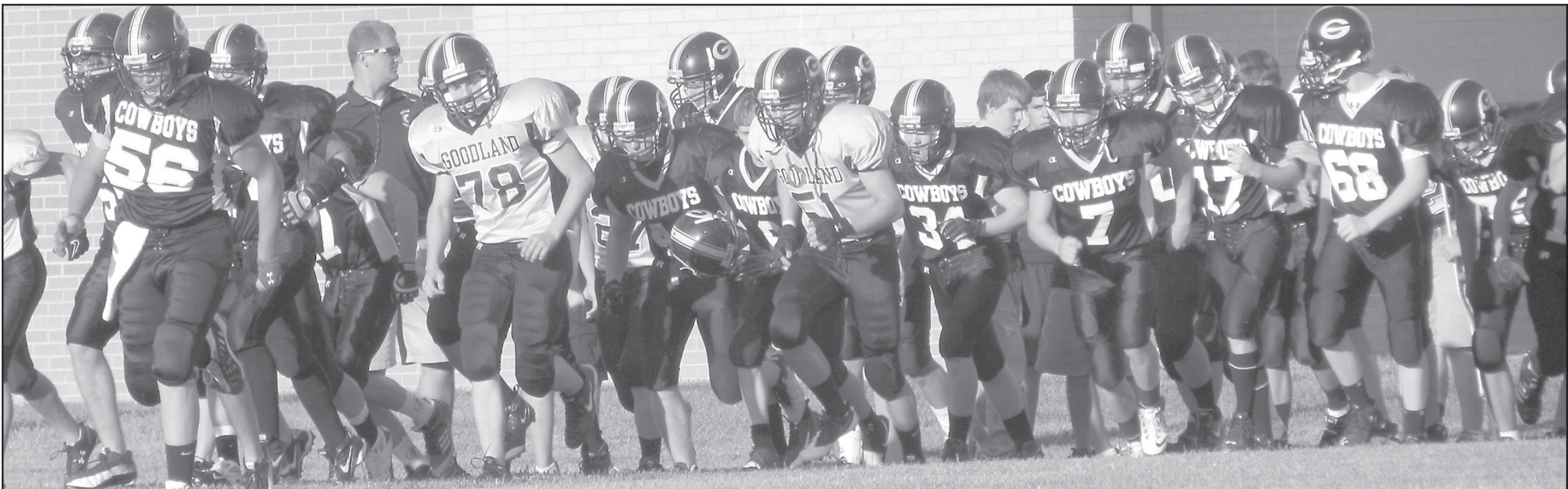
Cowboys football players took to the field on Friday for the sports drink scrimmage, and to show a good crowd of fans what to expect this season with the opener at 6:30 p.m. on Friday with Hugoton.