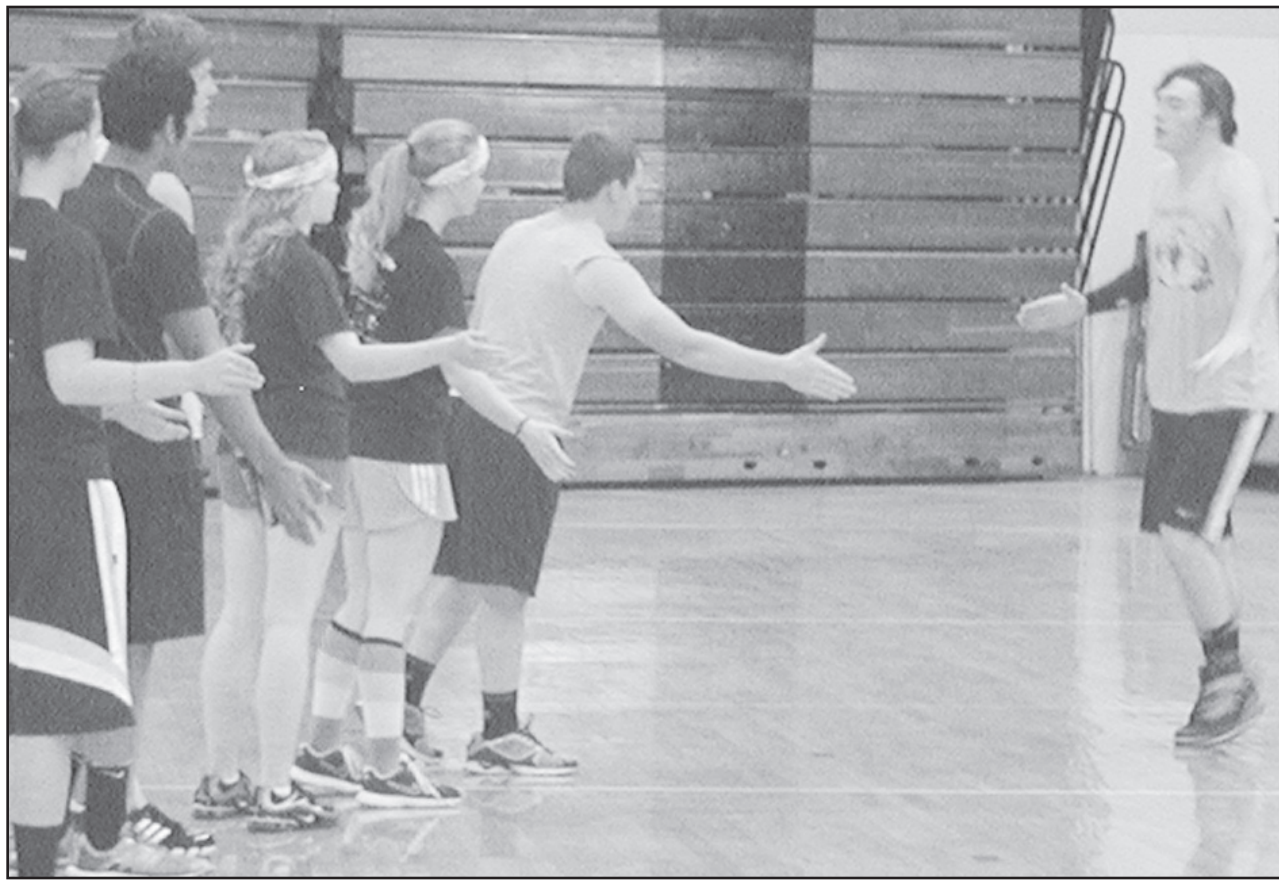
During the week before the start of winter sports the Family, Career and Community Leaders have a wiffle ball tournament for the students of Goodland High School. In wiffle ball the ball is made out of hard rubber and is designed to be used in small places, in this case the court of the Max Jones Fieldhouse. A runner at first (right photo) get ready to run for second. A runner heading for home is congratulated on his way to home plate.