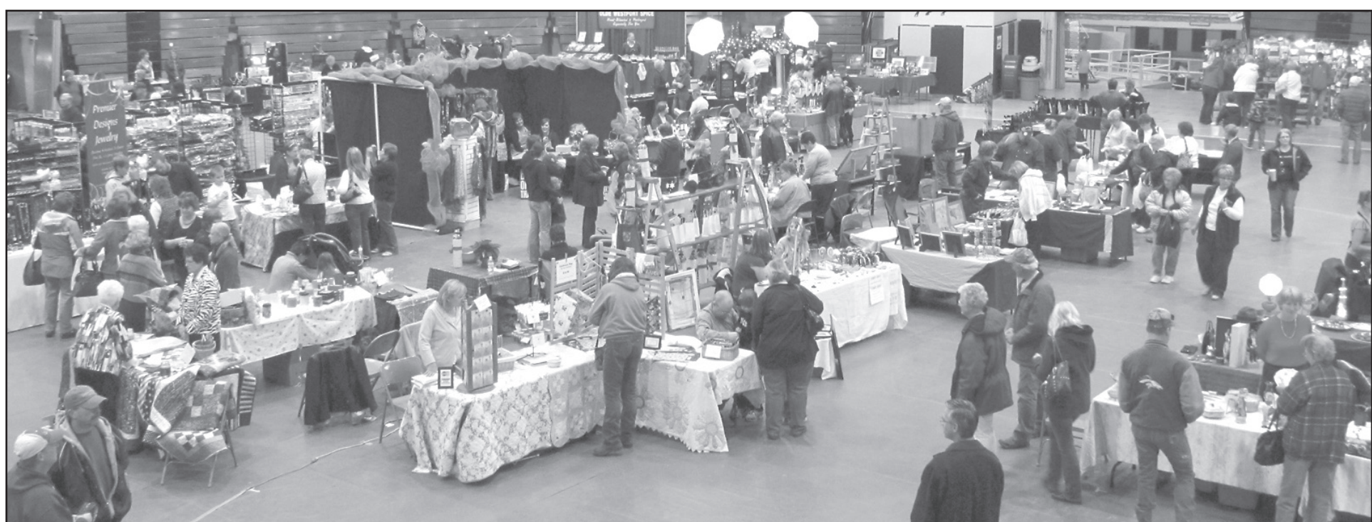
The Max Jones Fieldhouse main floor was nearly filled with more than 40 vendors Nu Phi Mu food and gift extravaganza held on Saturday. A wide variety of local and outside vendors were present.

The Cowboys and Cowgirls have begun practice for the basketball season. The scrimmage will be held on Tuesday, Nov. 29 and the first game is Friday, Dec. 2 at Max Jones. See photo on Page 10.