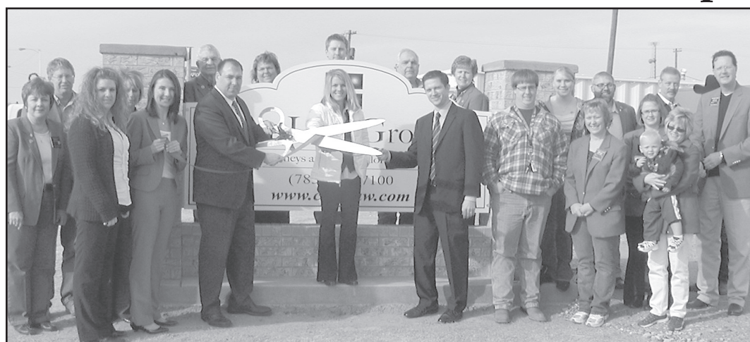
The Goodland Star-News and the Goodland Ambassadors would like to welcome Cure Law Group, LLC, to Goodland, Kan..

The Cure law Group consists of Attorneys and Counselors at Law, with services covering areas including business law, Criminal Law, DUIs, Civil litigation and Estate planning.