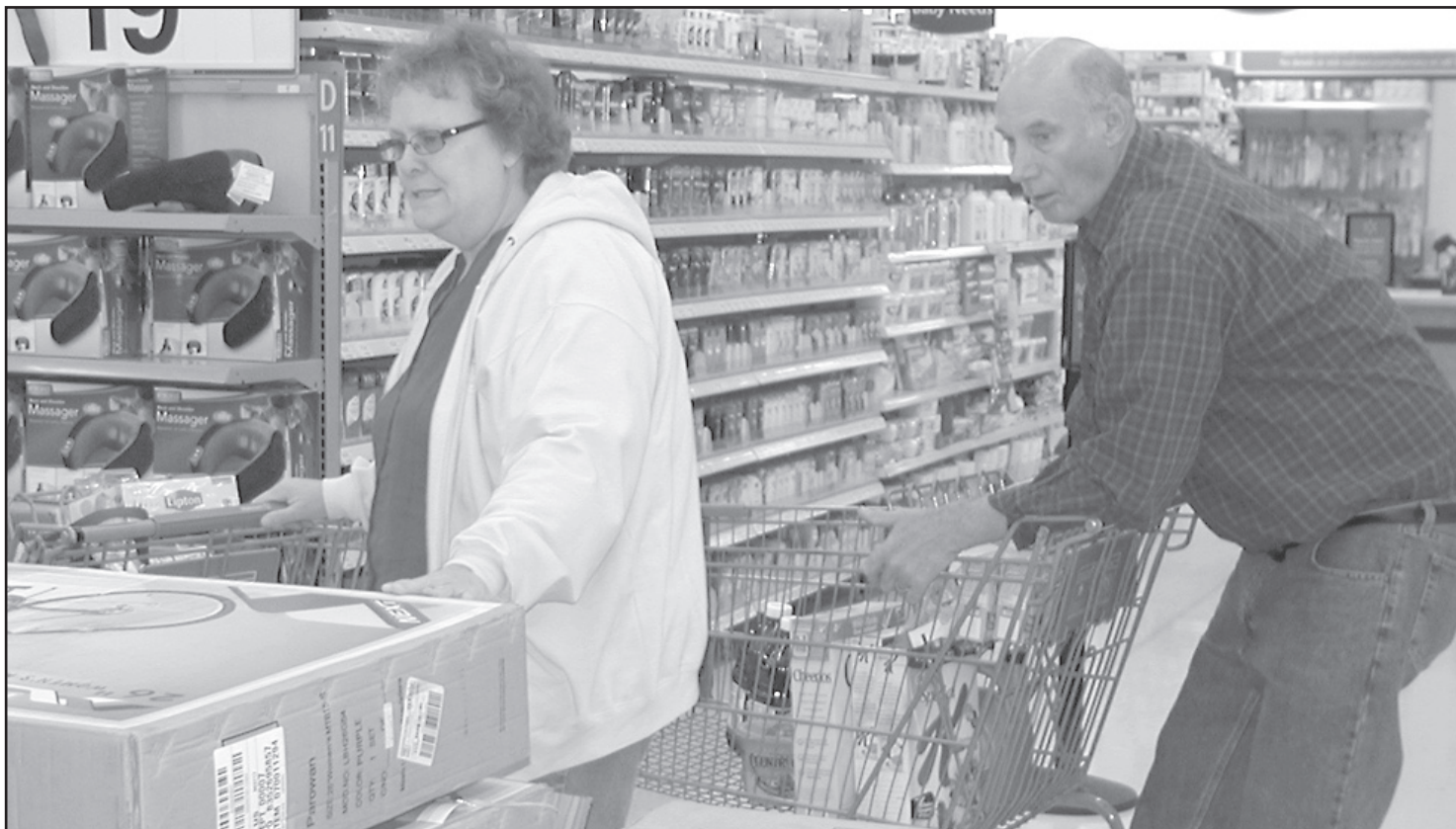
Two out-of-town shoppers were choosing a bicycle to be given as a Christmas present at Walmart over the Thanksgiving holiday at Walmart. There was a waiting line at the store when the sales

started Thursday at 10 p.m. for Black Friday.