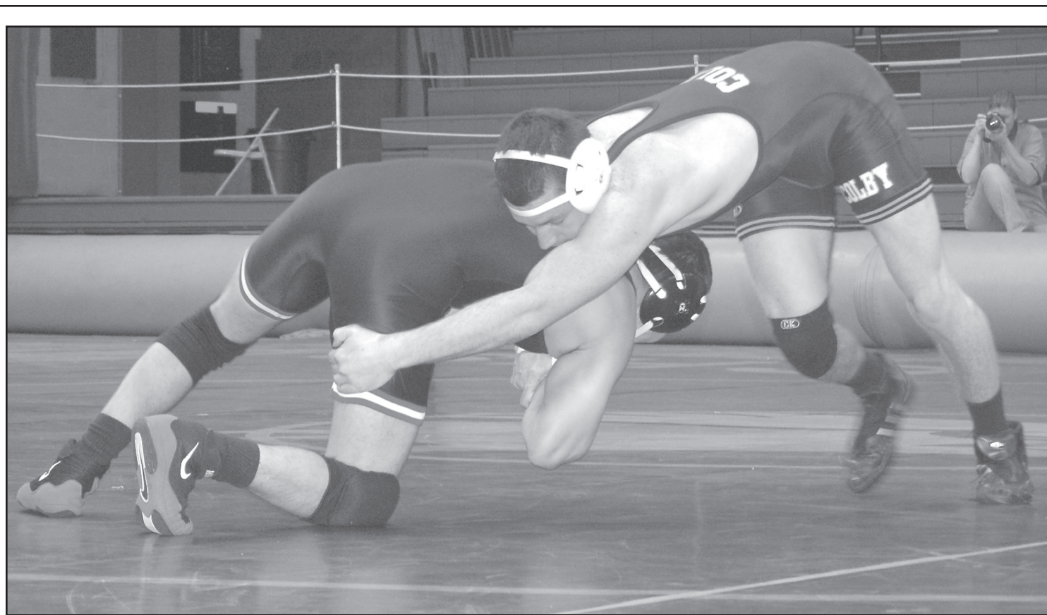
A Northwest Kansas Technical College wrestler squared off in Colby. The Mavericks fell to the Trojans 40-0.